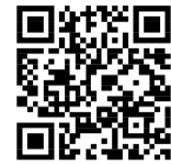
SC30m - EN